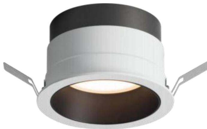
Super-slim Anti-glare Downlight

Like rising sun, shines its brilliance, it is an ideal choice for residential, commercial and hotel applications.